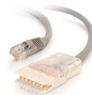
110 to RJ45 Patch Cord